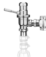
DOLPHIN TYPE 1 CLASS A

**Contact Your Local Sloan Representative